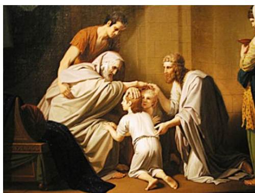
Jacob blesses Joseph's sons

In the Christian life the inheritance we pass down to our children is spiritual blessing.